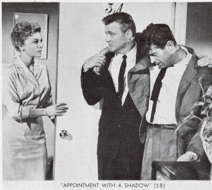
"APPOINTMENT WITH A SHADOW" (2-8)